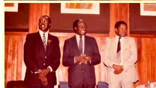
The late former President Mwai Kibaki on a visit to the institution in 1979, when he was Vice President.

CIDA supported the establishment of KTTC by funding infrastructure development, training programs, and educational materials. They facilitated the training of Kenyan educators in Canadian universities, enabling them to replace the Canadian teachers eventually. Approximately 135 Kenyans were trained and took over teaching roles at KTTC between 1978 and 1993, making it one of CIDA's most successful projects in Kenya.