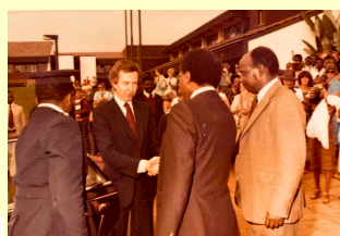
Official visit of the Right Honourable John Clarke, M.P, Prime Minister of Canada on 11th August 1979.

In 1979, the second President of Kenya, Daniel Toroitich Moi, presided over the first graduation ceremony. On August 11, the college welcomed a visit from Canadian Prime Minister Joe Clark, highlighting its significance as a project funded by the Canadian International Development Agency (CIDA), which implements Canada's international development cooperation programs in Africa, the Middle East, and Asia.