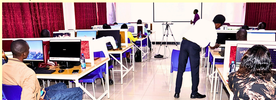
Technical Trainers undergoing training in one of the Jitume Labs at KSTVET

KSTVET's impact reaches far beyond its campus walls. Spearheading the training of trainers for the Jitume program, KSTVET plays a pivotal role in equipping young Kenyans with the skills needed for the digital economy. As Kenya embraces the digital age, the Jitume program is a catalyst for change, paving the way for a knowledge-based economy and sustainable development.