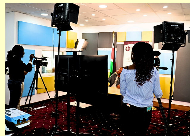
Technical Trainers in the National ODEL Center Studio

The commitment to quality assurance extends to collaborative teamwork and a community-centric approach to ensure that education becomes a catalyst for positive change. Quality assurance emphasises customer focus that is evident in the dedication to delivering education that meets global labor market needs and align with AU Agenda 2063, Sustainable Development Goals, Ministry of Education policies, and the TVETA ODeL standards.