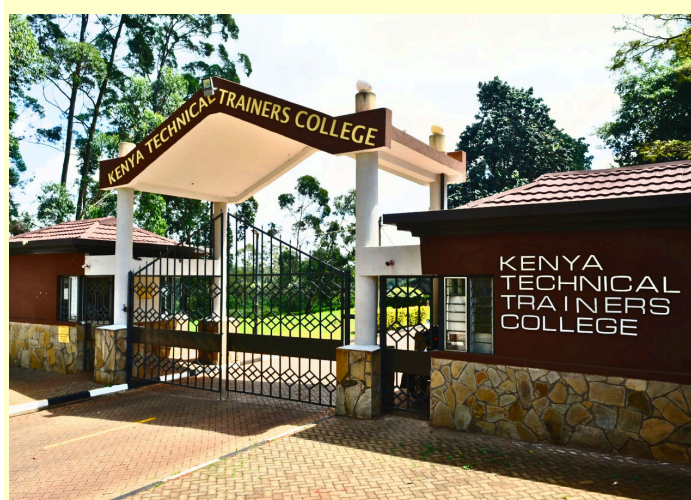
Kenya Technical Trainers College - KTTC